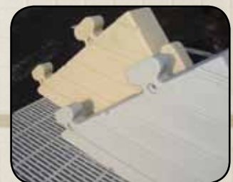
Other colors available upon special request.